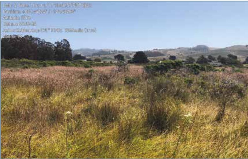
Parcels at Wavecrest that CLT has in escrow.

As of this writing, we have five parcels in escrow. This involves a labor-intensive process of staff time and transfer costs, including back taxes. Each parcel, even though donated or purchased at appraised value for non-profit acquisition, costs us an average of $5500 to acquire. This is primarily what your cash donations, specified for preservation of open space, cover.