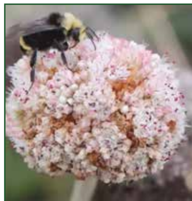
Seaside Buckwheat (Eriogonum latifolium)