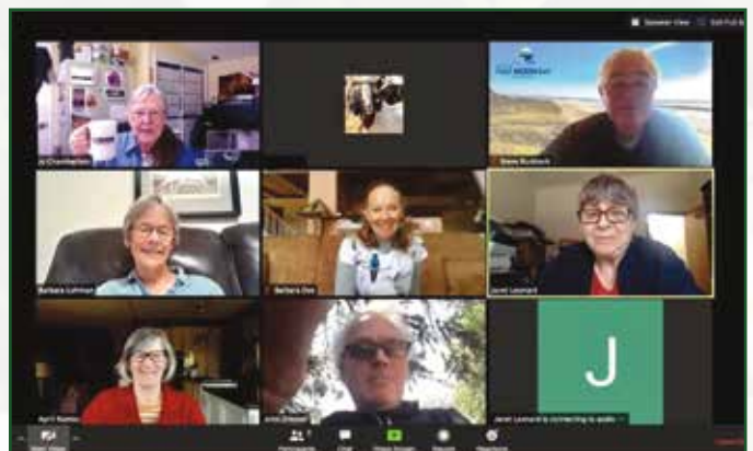
Hello from the CLT Stewardship Committee. This dedicated group continued to work together remotely to preserve, monitor and protect our open space land. We are all thankful for the important work that they continue to do.