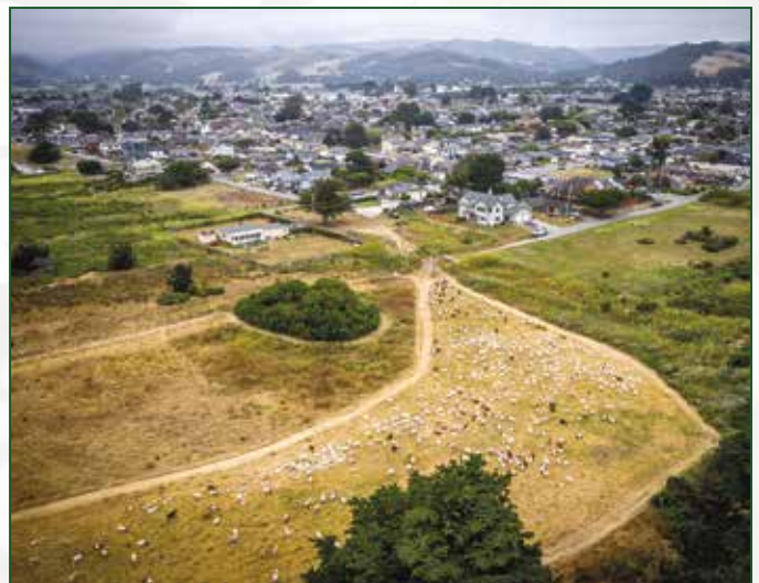
Another kind of land stewardship: This aerial view shows the goats and sheep clearing open space.