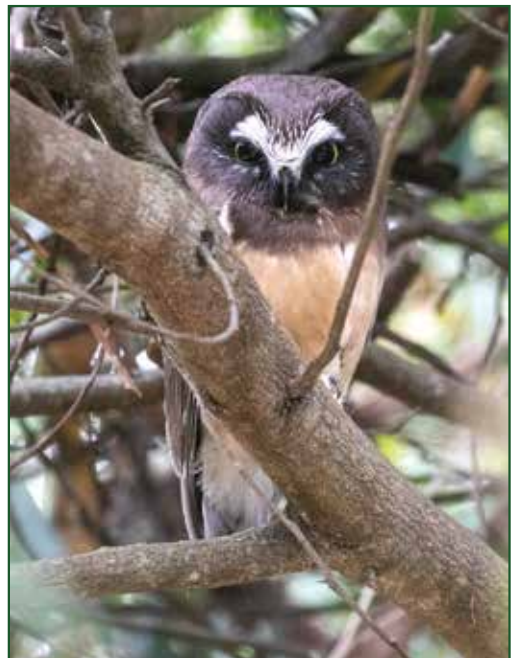
Norther Saw-whet Owl Fledgling at Wavecrest