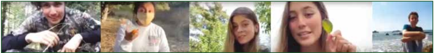
The virtual program featured bi-weekly talks given by local environmental experts, followed by activities and scientific reflection presented by the Half Moon Bay High School environmental science students, shown above.