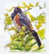
Spotted Towhee Barbara Dye