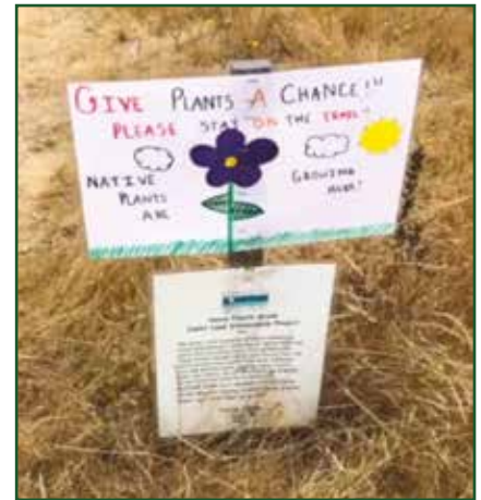
One of the signs created by JLS students to alert the public to stay on the trail.