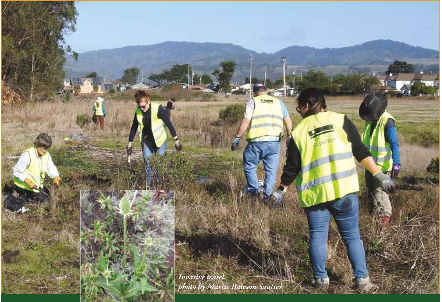
Invasive teasel, photo by Martie Bateson Sautter

We got in one Wavecrest Workday on January 11, 2020 before Covid restrictions brought our workdays to a halt. This hardy group of volunteers worked diligently removing invasive teasel. The bottom photo shows a previous year's volunteers and their mammoth clean-up result.