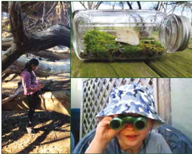
A JLS student working on her journal, one of the mini bottle ecosystems created by JLS students and one JLS student checking out the binoculars.