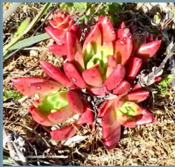
Bluff Lettuce

Coastside Land Trust is dedicated to the preservation, protection and enhancement of the open space environment including the natural, scenic, recreational, cultural, historical, and agricultural resources of Half Moon Bay and the San Mateo County coast for present and future generations.