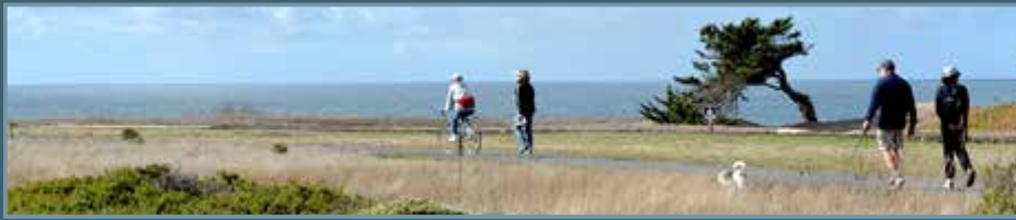
Wavecrest Trail