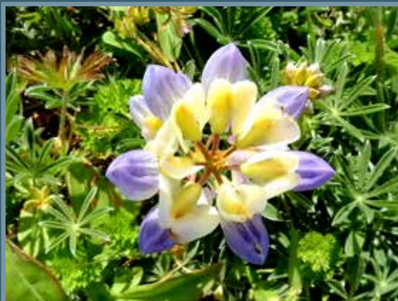
Lindley's Varied Lupin