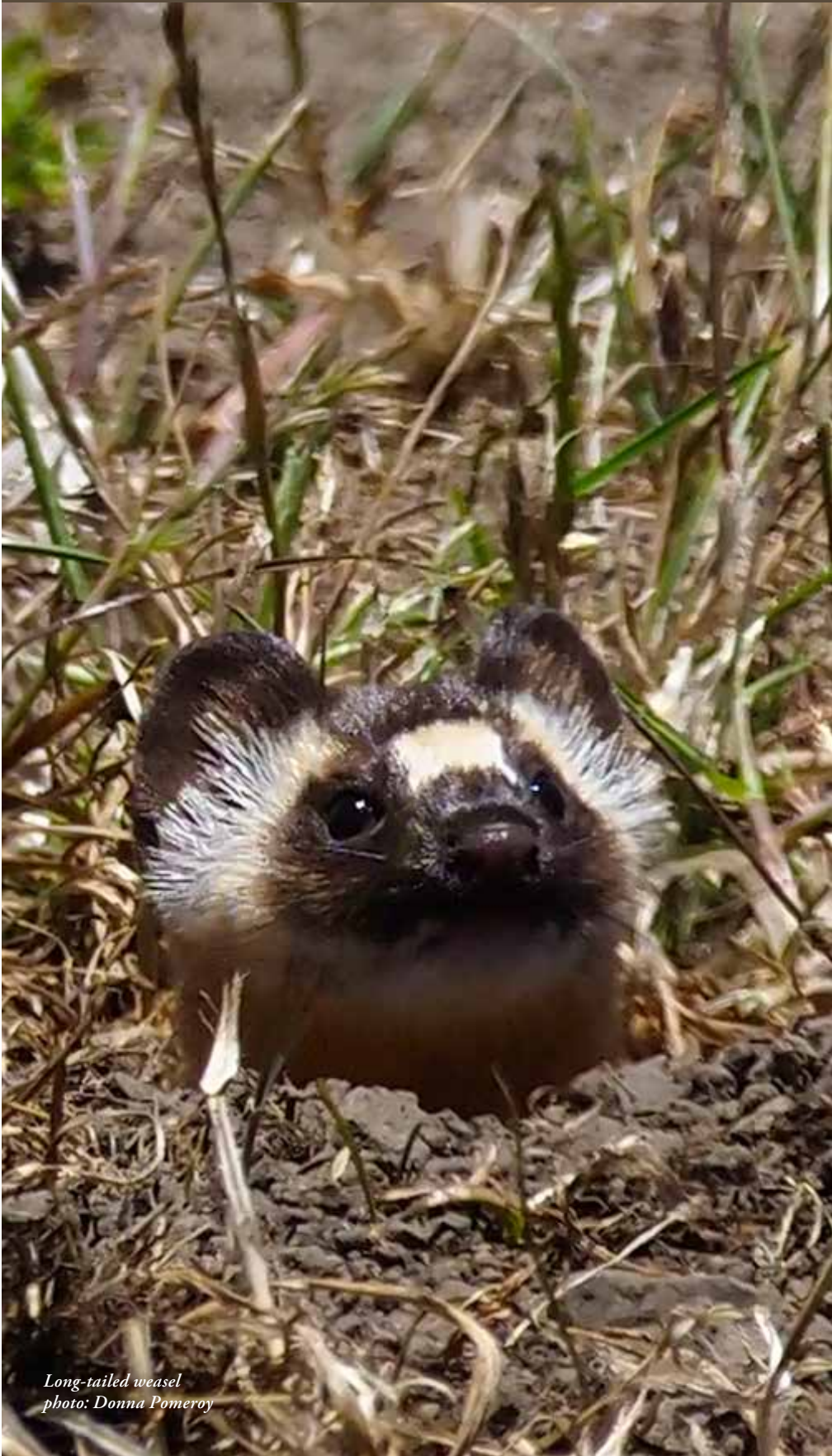
Long-tailed weasel