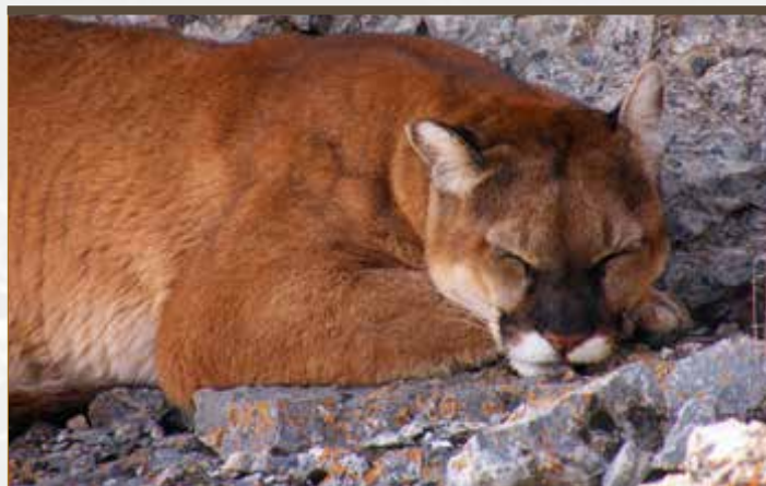
November Wildcats of Coastal San Mateo, Mountain Lion

Please take a peek at the “Upcoming Webinars” in the News and Events section of our website to see what is happening in 2022. https://www.coastsidelandtrust.org/webinars You can also view the recordings of all of these presentations in the past webinars section of our website, as well. https://www.coastsidelandtrust.org/past-webinars